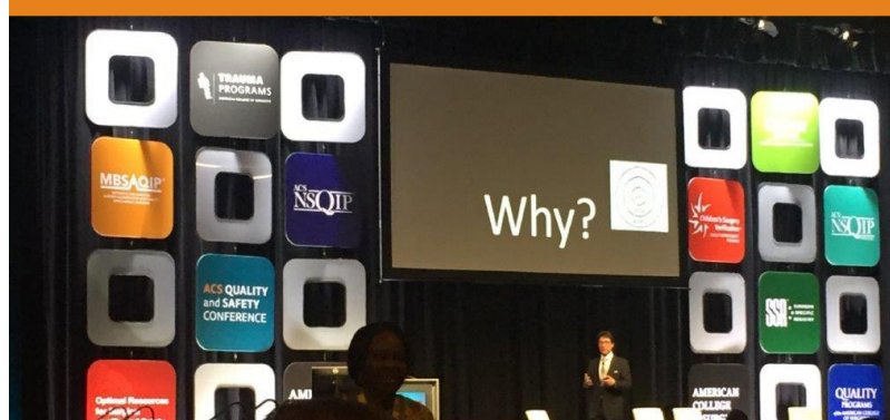
Questions answered and ideas shared at the American College of Surgeons Quality and Safety Conference in Orlando, FL (July 21-24, 2018).