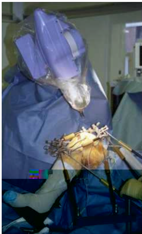
Figure 3 The ACROBOT system