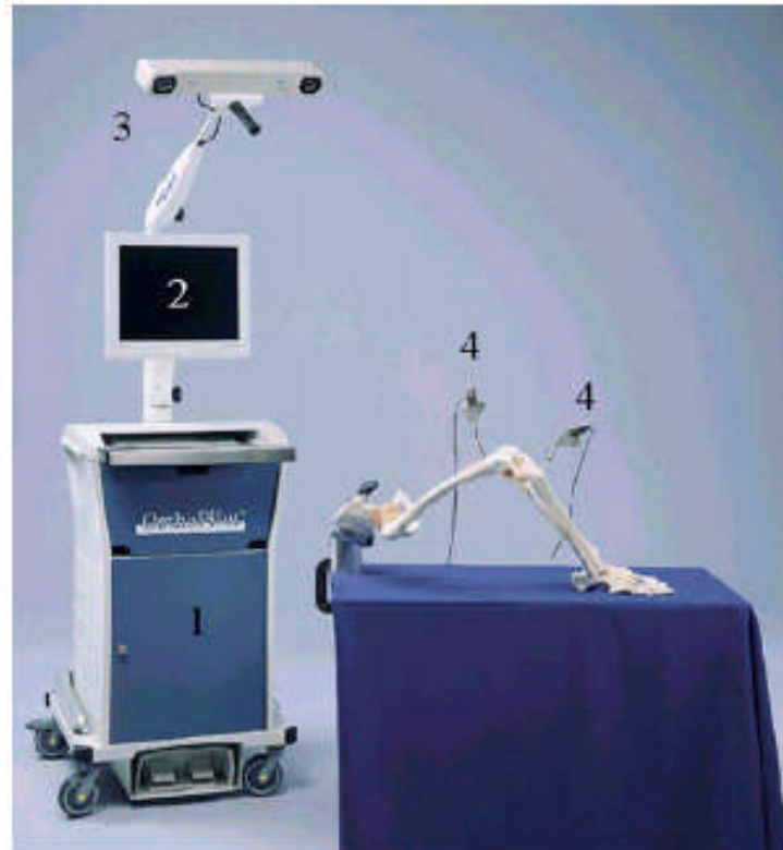
Figure 1 The OrthoPilot navigation system (1 Computer, 2 Monitor, 3 Infrared camera, 4 Localizers)

Reproduced with kind permission from Springer Science and Business Media, and the author; From Jenny JY, Boeri C. Unicompartmental knee prosthesis implantation with a non-image-based navigation system: rationale, technique, case-control comparative study with a conventional instrumented implantation. Knee Surgery, Sports Traumatology, Arthroscopy 2003; 11(1):40-45.