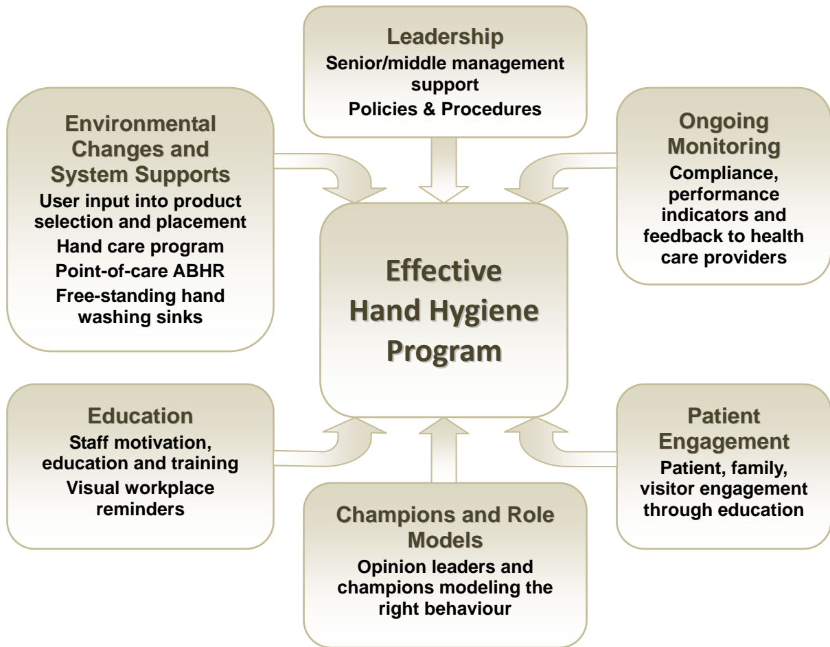
FIGURE 1: Components of a Multifaceted Hand Hygiene Program