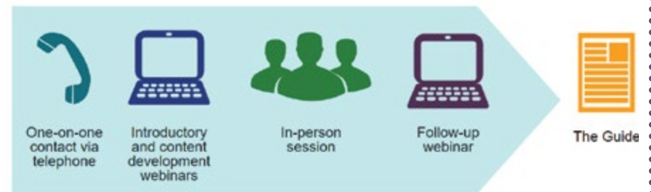
Figure 3. The process of engaging patients in the development of this Guide